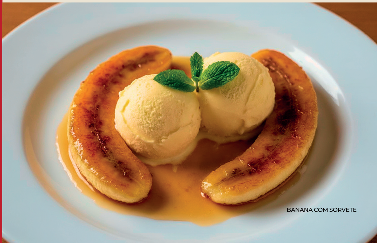
BANANA COM SORVETE